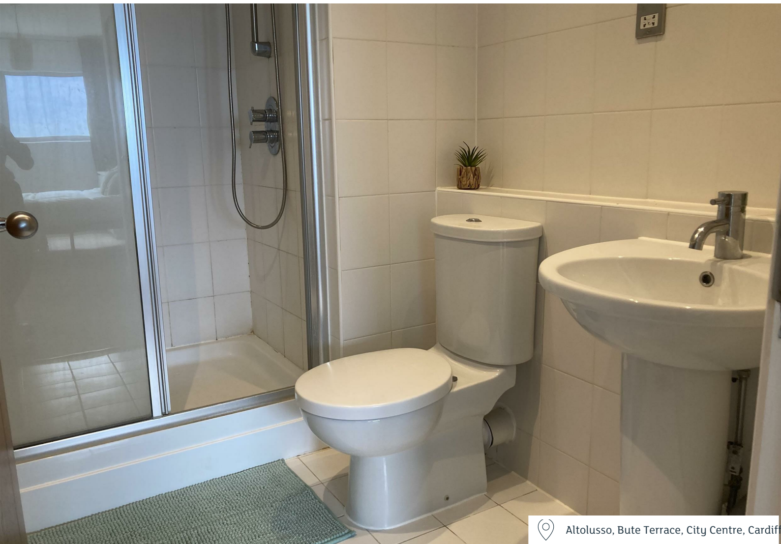
Altolusso, Bute Terrace, City Centre, Cardiff